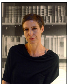
Printed with permission. © Daniel Straked