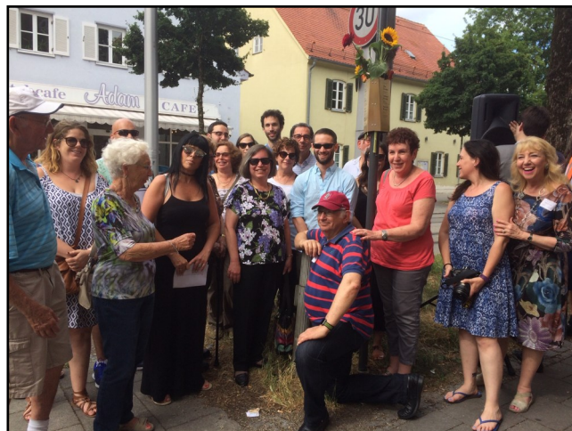
The Einstein family descendants place an Erinnerungsbänd at Ulmerstraße 185, Kriegshaber in 2017.

The cost for a Memory Post is approximately €390. The cost for a Stolperstein is approximately €130.