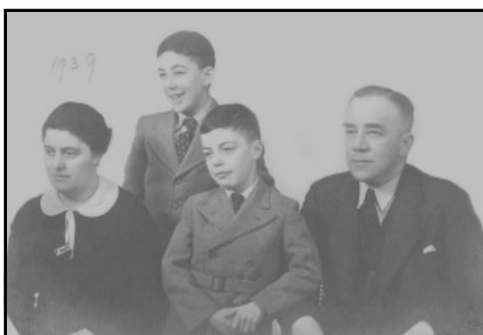
The Stern Family in Augsburg