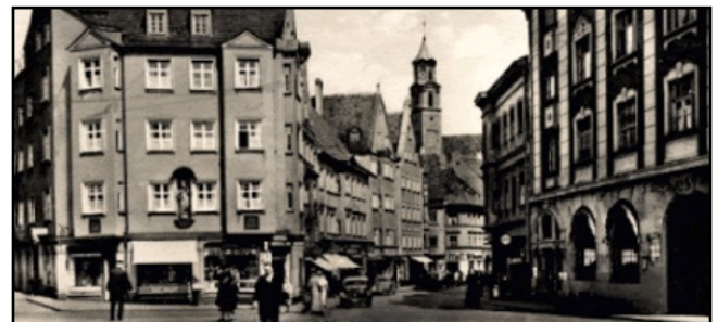
This was the way the intersection of Annastraße in Augsburg looked at that time.

Help also came from the former cook and other employees of Jewish families in town. They would bring an egg, a piece of meat, a vegetable - all very welcome for a family with very little food. Often they would bring it to my apartment for distribution to other Jews. They chose our place rather than a "Judenhaus" because it was safer to bring it to my apartment since my Father was not Jewish. ☘