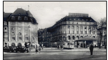
The Königsplatz located in the center of Augsburg square

There was a fish store in town, supposedly without fish, since rumor had it that it was too difficult to transport the long way from the ocean.