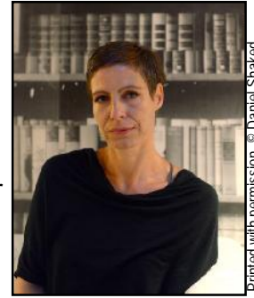
Printed with permission.